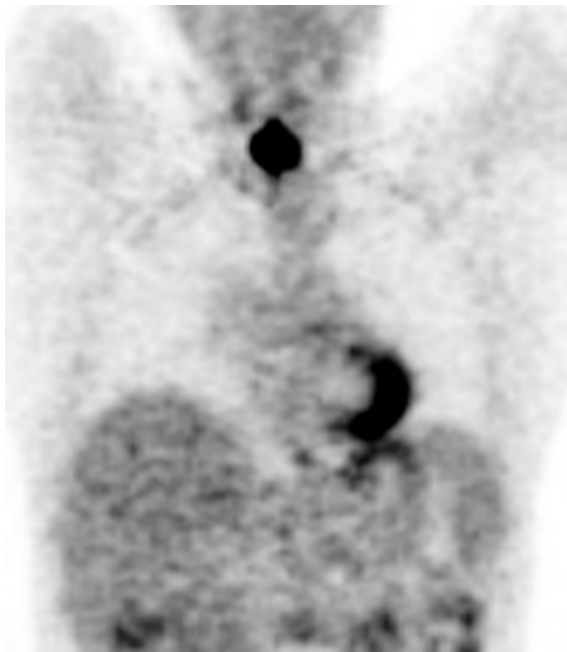
Figure 1. 18F-FDG PET-CT Identified a Single Neck Hypermetabolic Lesion

We present a 61-year-old woman with no relevant medical history, born in northern Portugal, where she has always lived. When a neck mass was noticed, neck ultrasound was performed showing two solid thyroid nodules, one in the right lobe with about 3 cm and another in the left lobe with about 9 mm. There were no associated compression symptoms. Fine needle aspiration (FNA) cytology was held reporting "suspicious for malignancy". The patient underwent total thyroidectomy and histological examination showed a 35 mm heterogeneous and hemorrhagic vascular neoplasm with dilated vessels, areas of necrosis, with swollen endothelial cells and atypical mitoses between thyroid follicles and cells. Immunohistochemistry staining showed negative results for cytokeratins MNF, CAM5.2, CD34, thyroglobulin and positive finding for CD31. These findings confirmed the diagnosis of angiosarcoma. A 4 mm papillary microcarcinoma was also identified in the left lobe, without any poor prognosis criteria. Neck computerized tomography (CT) scan performed two months after the operation showed a 35 mm nodular lesion in the right surgical bed, with irregular margins, conditioning tracheal deviation. The patient was referred to our institution. FNA of the nodule was held showing local recurrence of the previously diagnosed malignancy. 18F-FDG PET-CT identified a single neck hypermetabolic lesion compatible with tumor recurrence (Figure 1).